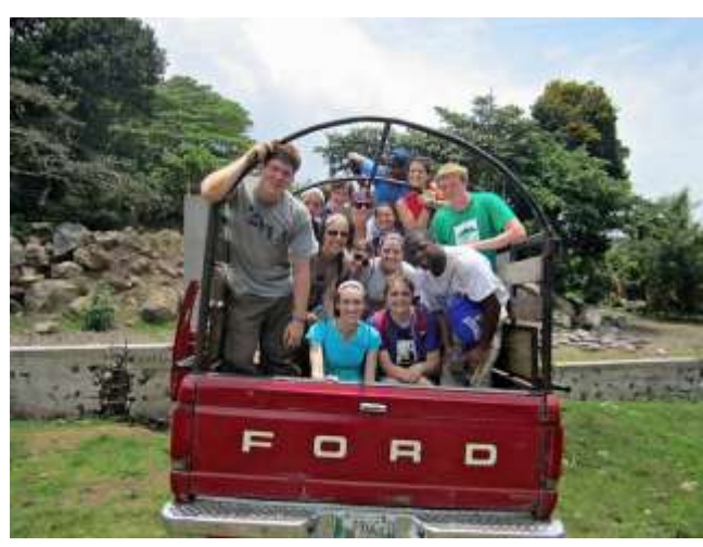
Members of the Guatemala Trip leaving work.

During my time in here, I will learn a new culture, and also to appreciate a way of life that revolves around community as opposed to the individual. Furthermore, I know I will never lose the feeling of love that emanates from the smiles on the faces of my students.